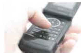
CALL TO NON-SMARTPHONE

NOTE: DoIT recommends printing out a set of passcodes and also registering at least one secondary phone number as your backup methods for authentication.