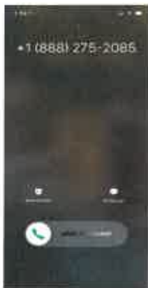
CALL TO SMARTPHONE