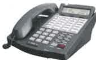
CALL TO LANDLINE