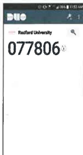
GENERATE A PASSCODE