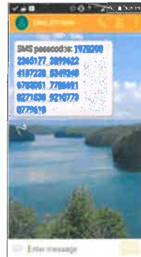
RECEIVE TEXT WITH PASSCODES