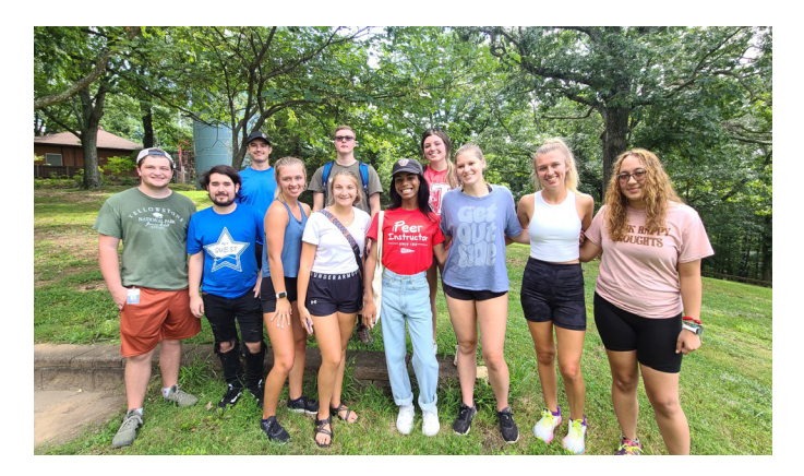
STAR TREK Roanoke, Virginia