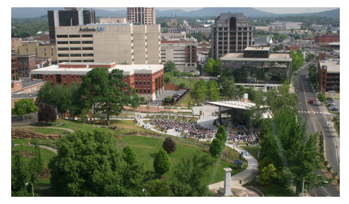
RADFORD NIGHT AT ELMWOOD PARK Roanoke, Virginia