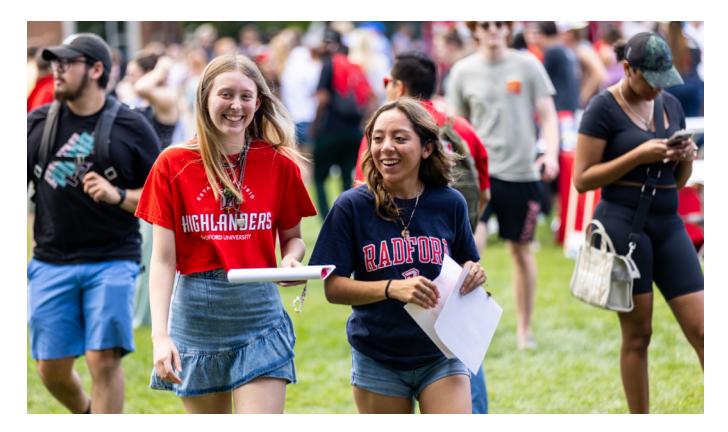
CLUB FAIR Radford, Virginia