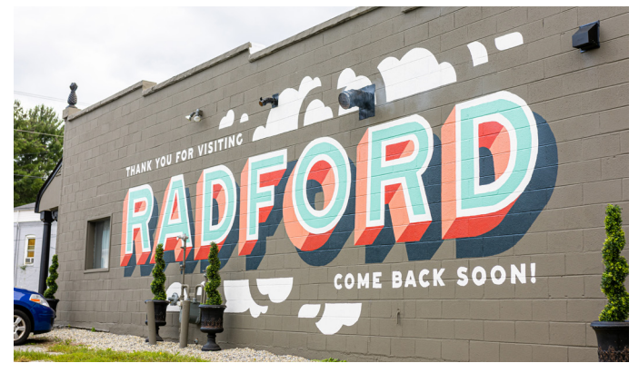
STREET FESTIVAL Radford, Virginia