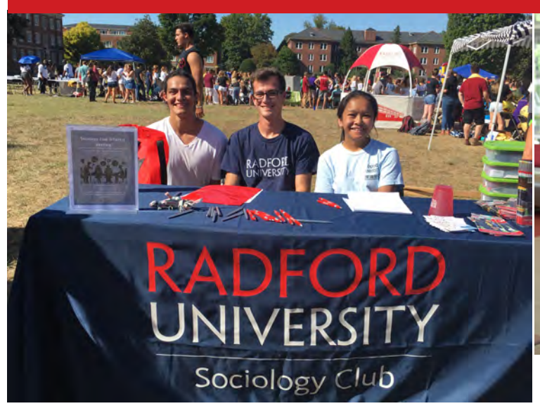
Sociology Club table at the Club Fair.