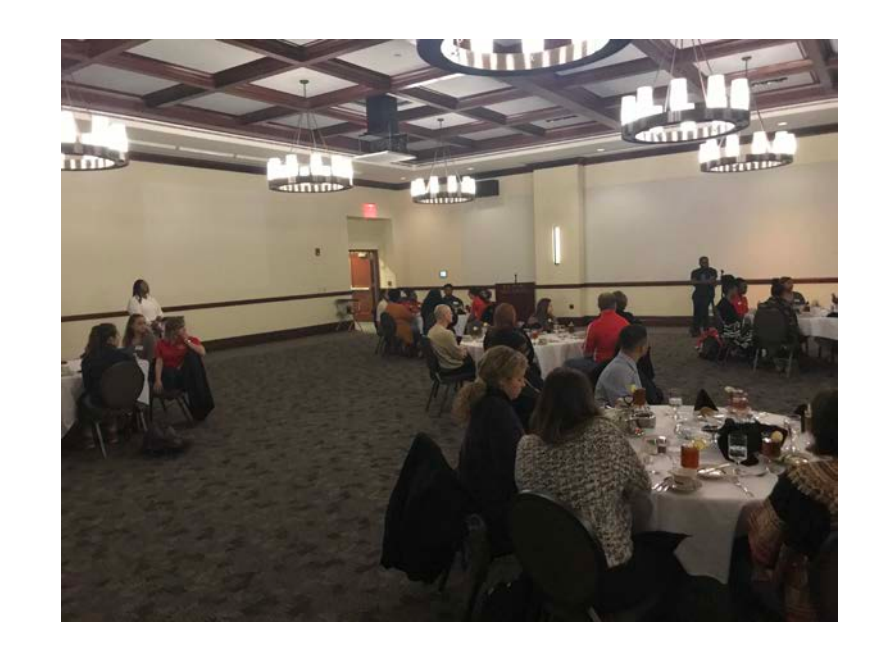
Page 71 of 86