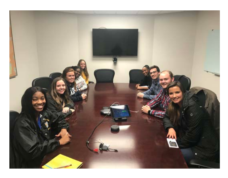
Highlander Believers Student Committee