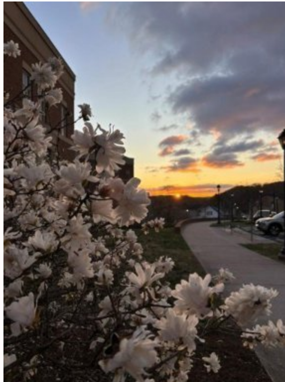
Dawn by Davis College