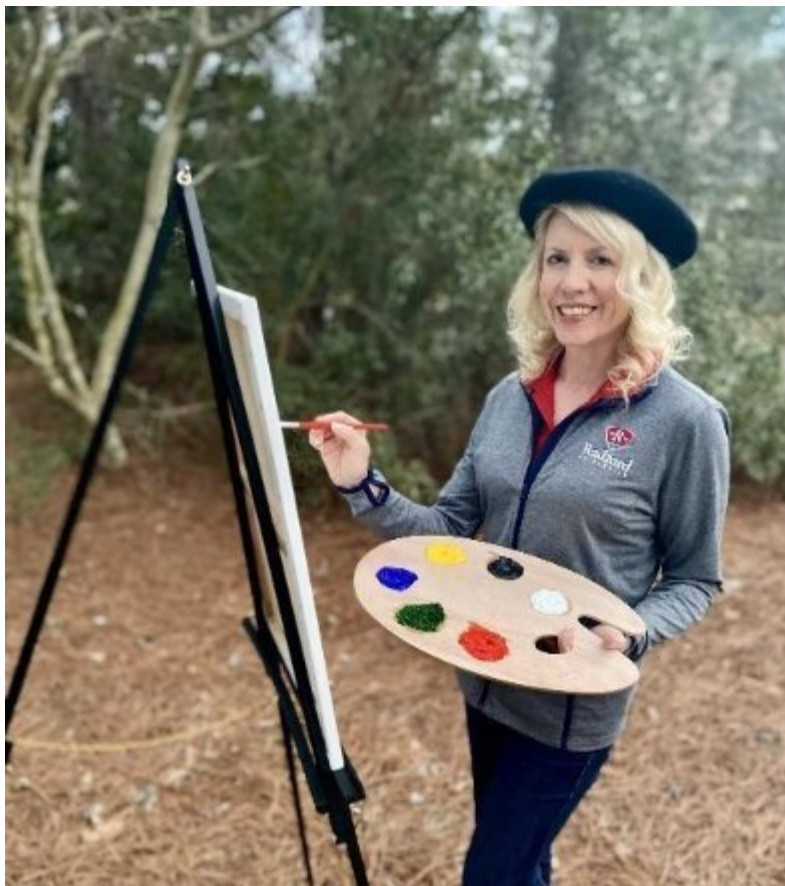
A Picture of Health: How We Create Thriving Communities Together

What makes a community healthy? It's more than healthcare—it's shaped by many factors, such as the air we breathe, food we eat, places we live and work, and relationships we nurture. Everyday forces shape our well-being, determining whether we thrive or struggle with chronic disease—a leading cause of death and disability in the United States.