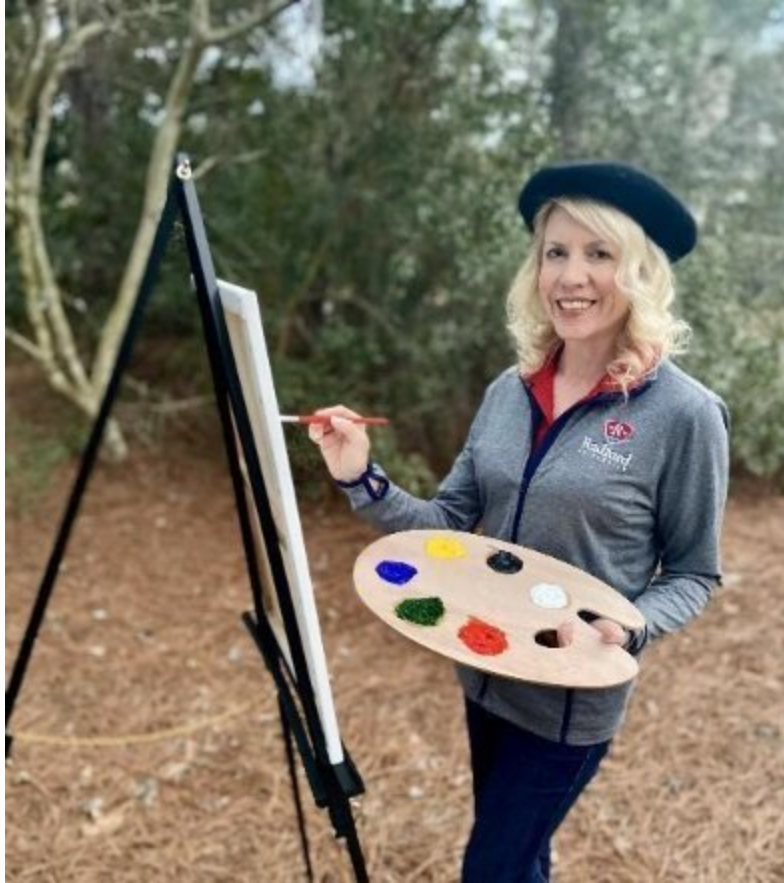
A Picture of Health: How We Create Thriving Communities Together

What makes a community healthy? It's more than healthcare—it's shaped by many factors, such as the air we breathe, food we eat, places we live and work, and relationships we nurture. Everyday forces shape our well-being, determining whether we thrive or struggle with chronic disease—a leading cause of death and disability in the United States.