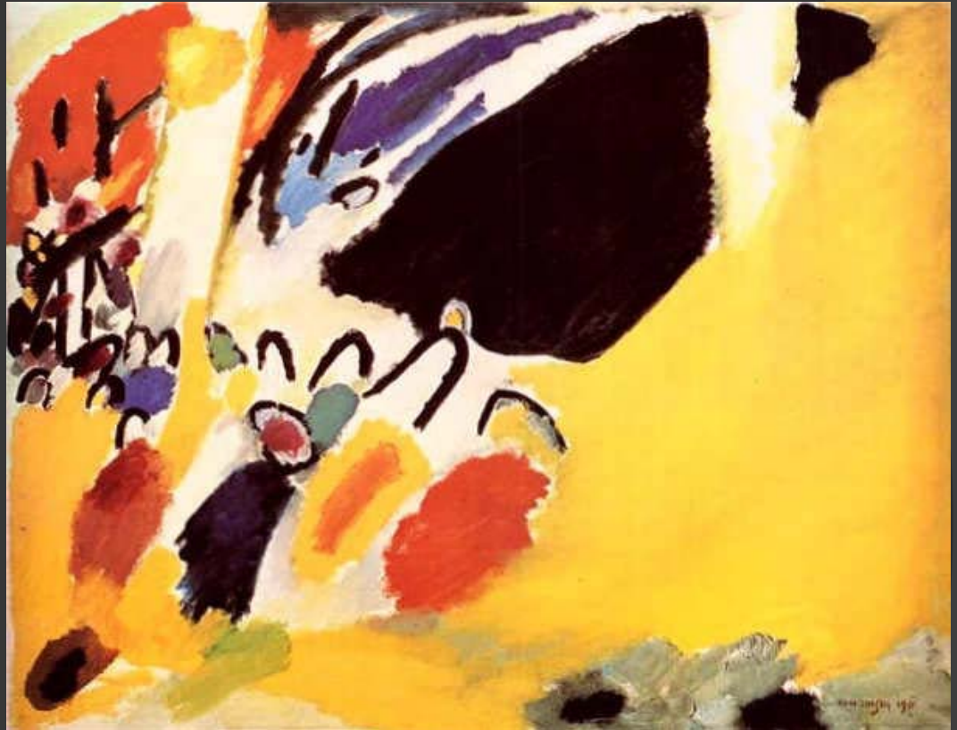
“Impression III (Concert) 1911

Kandinsky was heavily influenced and inspired my music and believed it was the ultimate form of artistic abstraction. The music of the concert conjured emotional impulses in which he expressed through colors, which is his internal “impression” of an external nature. He believed these bright colors had a psychological power and exerted a direct influence upon the soul, in which he developed the principle of internal necessity (Art in Theory, pg. 89).