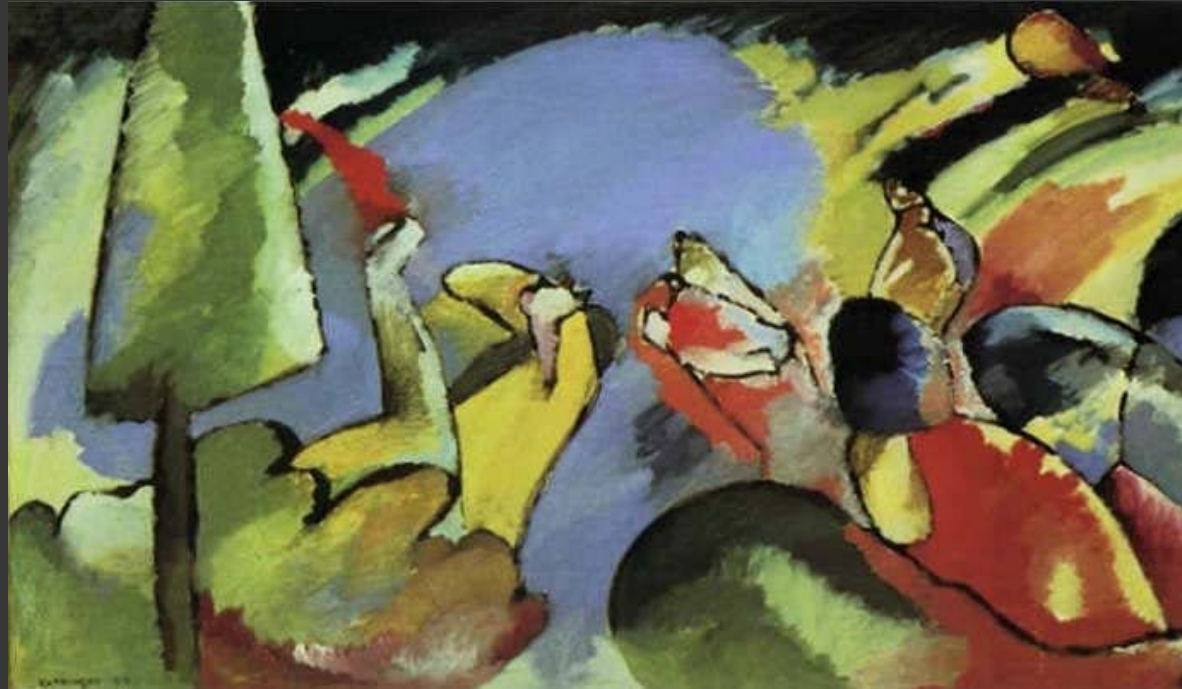
“Improvisation XIV” 1910

Kandinsky moves into abstraction through various Impressions, Improvisations, and Compositions which can sometimes be interchangeable. His Improvisations are inspired by spiritual events and impulses. His work becomes less about truly representing landscapes and more about vague forms and color experimentation.