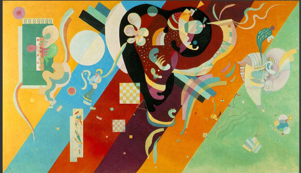
“Composition IX” 1936

Although these paintings suggest infinite space rather than material representations of the world, and are so different from his prior works, Kandinsky continues to paint to commit to his inner necessity. He continues to stay true to himself as an artist, paint through his impulse to “purposefully create”, and captures the spirit and new developments and ideas within his age (the pyramid of inner necessity, The Spaces of Spirituality and Absolute Abstraction: Kandinsky ).