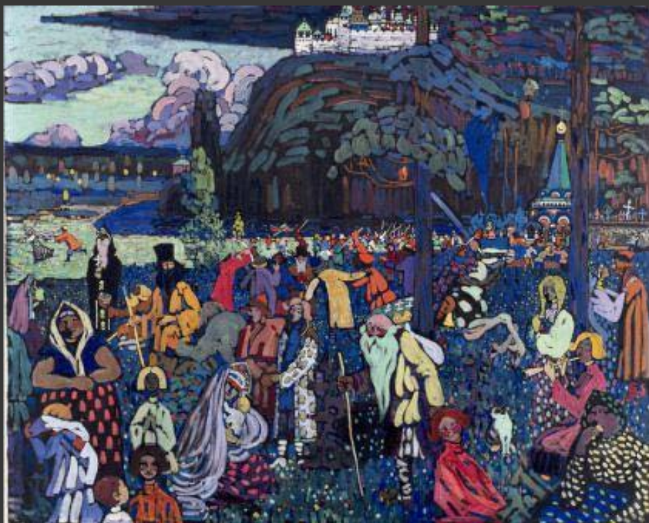
“Motley Life” 1907

This painting by Kandinsky relates to the above quote because he uses bright colors to stir an “inner vibration” of the soul. This piece represents the idea of combined Russian beliefs in Christianity and paganism, but uses nonrepresentational colors to evoke dormant spirits within the viewer along with symbolic cues. This painting is an example of Kandinsky’s belief that art should be a “child of its time.” Through his travels he developed a sense of being implemented into the great painting of life, to “live” in the picture.