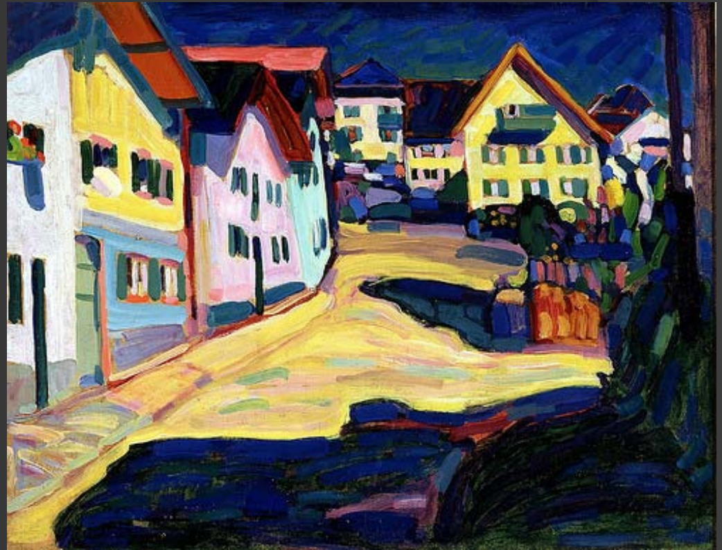
“Houses in Murnau” 1908

“Houses in Murnau” is an example of the influence of fauvism on Kandinsky’s work. Bright colors become fundamentally significant in his paintings and he migrates away from post-impressionist landscapes. Although color is a significant aspect of Kandinsky’s art, it is not the key to him as an artist. His goal was simply to “paint good, necessary, living pictures, which are experienced properly by at least a few viewers” (Art in Theory, pg. 93).