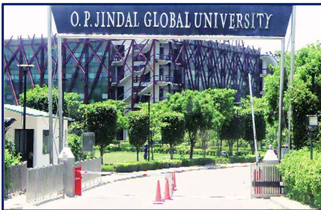
O.P. Jindal Global University

University Campus: Sonipat Narela Road, Near Jagdishpur Village, Sonipat, Haryana - 131 001, India.