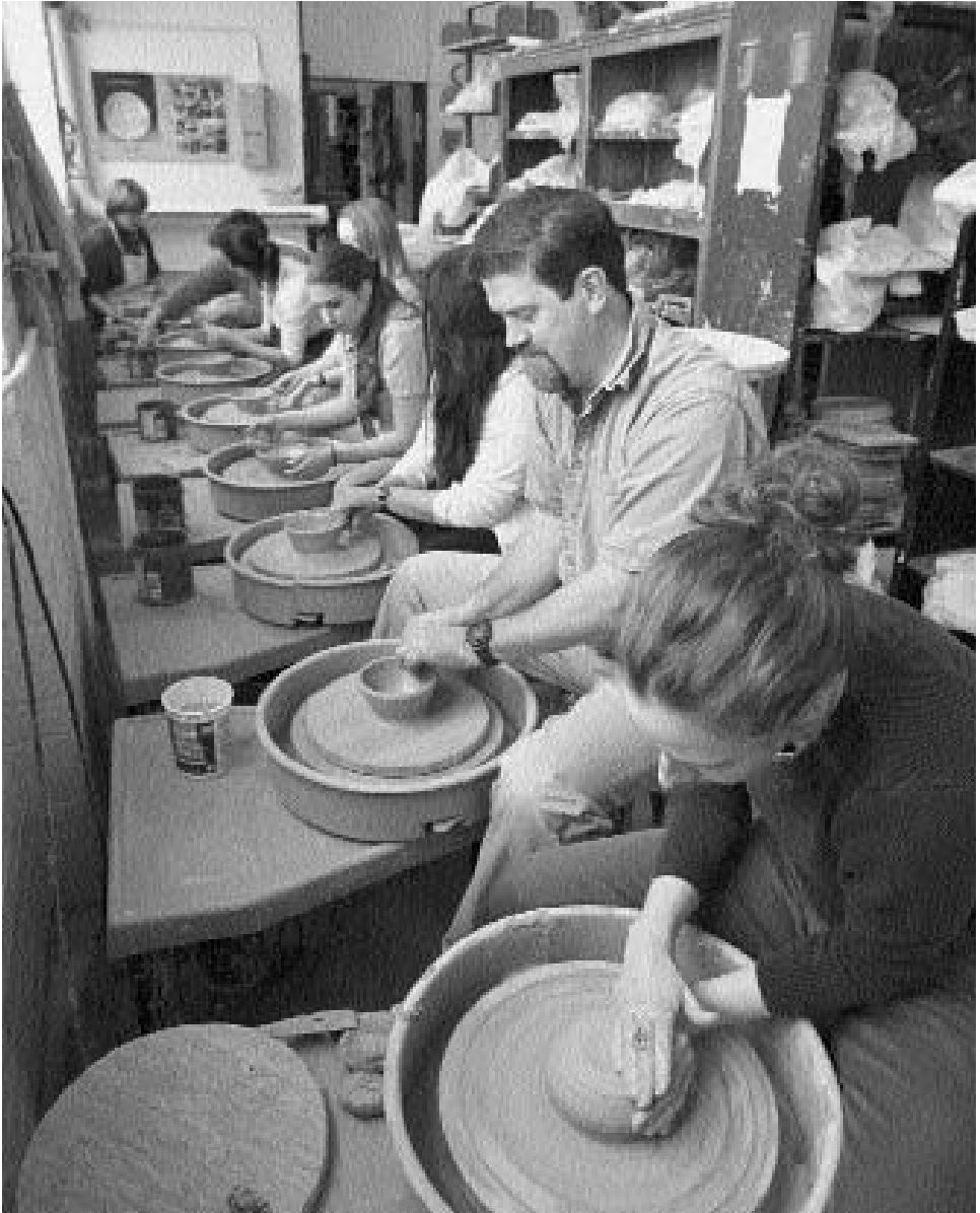
Art Education students throw clay bowls on the potter's wheel. This special class project – “Empty Bowls” – was a fundraiser for a local charity, “Beans and Rice.”

students to be comfortable with the dynamics of change. Faculty in this college have a strong commitment to continuous review, evaluation, and improvement of curricula in partnership with professionals in the IT industry in order to meet the emerging needs of society.