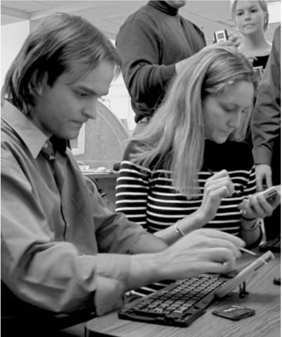
RU students have access to the latest classroom technologies.

It also seeks to help the entire campus community understand and appreciate the rich variety of cultures represented by our international student body.