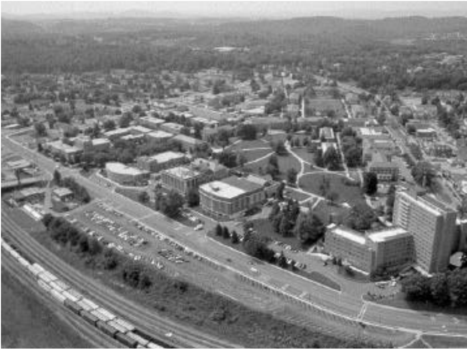
Radford University, nestled in the Blue Ridge Mountains of southwest Virginia, has a 177-acre campus located in the City of Radford.

Radford University Graduate Catalog 2001-2002, Volume 88, Fall 2001. Published by the Office of Public Relations, Radford University, East Main Street, Radford, Virginia, 24142, once a year. Students who matriculate at Radford University at the beginning of the 2001-2002 academic year will use the 2001-2002 Radford University Graduate Catalog for the official description of policies they must follow and requirements they must satisfy in order to graduate. Students may, however, elect to follow all the policies and meet all the requirements of a Radford University Graduate Catalog published subsequent to the year of their matriculation subject to the limitations detailed in "Graduation Policy" on p. 55. Radford University reserves for itself and its departments the right to withdraw or change the announcements made in this catalog.