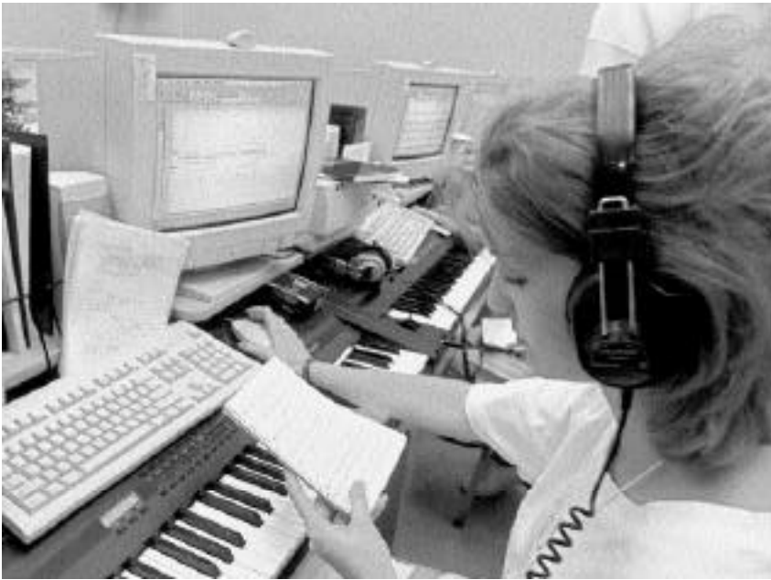
The graduate program in music provides advanced study for those seeking careers as music therapists and school music educators.