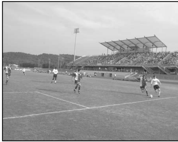
Radford University's Patt Cup Stadium Home of the Highlanders Soccer Team