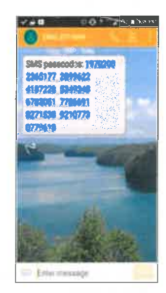
RECEIVE TEXT WITH PASSCODES