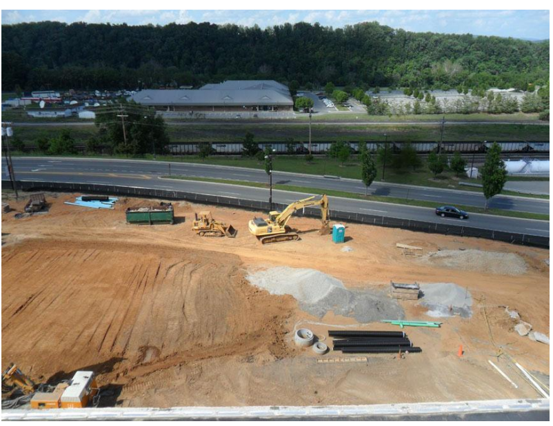
Image taken from the roof of Curie Hall, looking where the Curie parking lot used to be. The new planetarium will be near the light-blue plastic towards the left of the picture.

Nothing functional has been lost due to the redesign re-bidding process. What has been reworked involve features that were not essential to the programs that are scheduled to occupy the