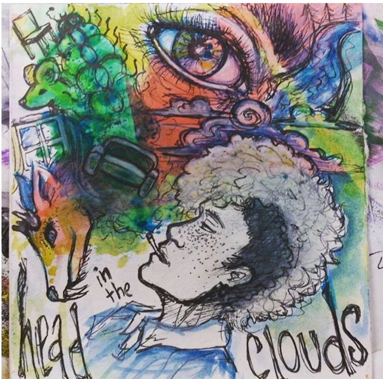
Art by Kyren Strakovsky