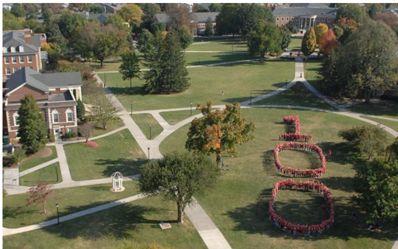
Students in "Dread the Red" shirts form "100" on Muse Quad lawn.

Specifically, Mycoskie encouraged R.U. students to be like Henry D. Thoreau and simplify their lives. He lives on a sailboat and has his books stored in a warehouse. He said he'd have to "dump stuff" before he could add anything to his house on the water. He's taken shoes personally to kids in places like Africa and Argentina. And the Argentina kids have taught him "the quantity of stuff (in your life) can really