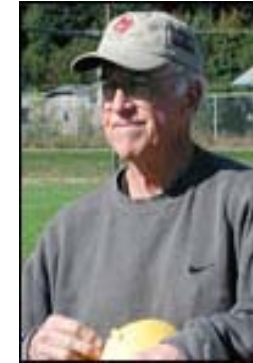
Probable Guest Coach - Harold Connolly

It's a good idea to label all personal items to prevent loss